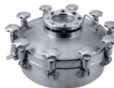
D13 - PED Certified