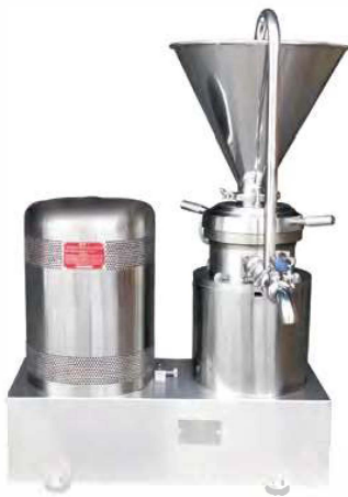
Sanitary split-case colloid mill (COL-V) (sanitary version)