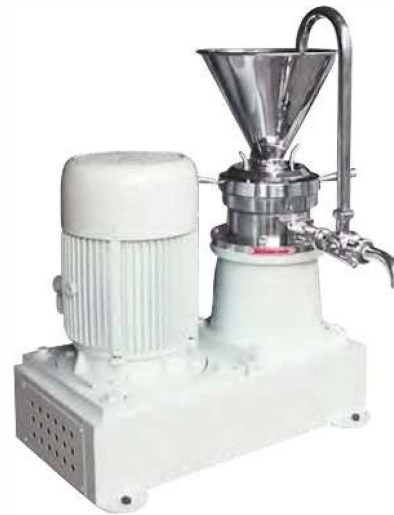
Normal split-case colloid mill (COL-V) (normal version)