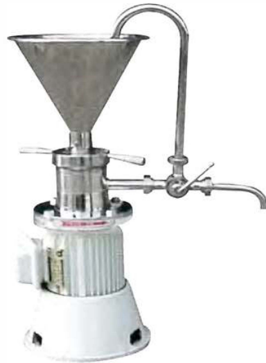
Normal vertical colloid mill (CO-V) (normal version)