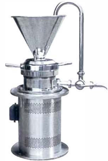
Sanitary vertical colloid mill (CO-V) (sanitary version)