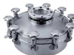
D13 - PED Certified