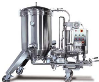
Vertical screen filter