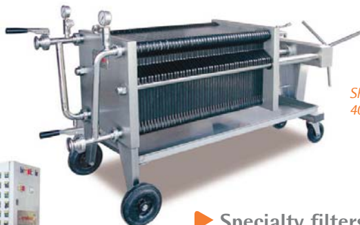
Sheet filter 400x400