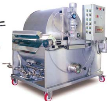
Rotary vacuum filter 2m 2