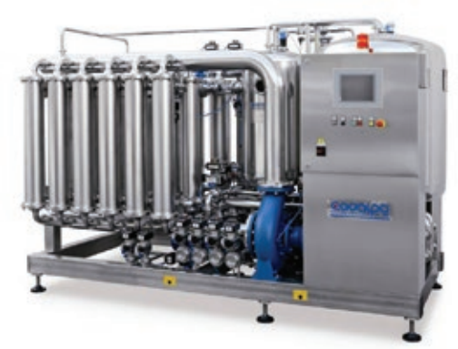
Plate and frame filter