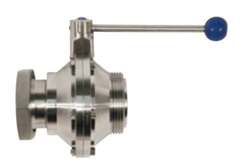
D series ball valve