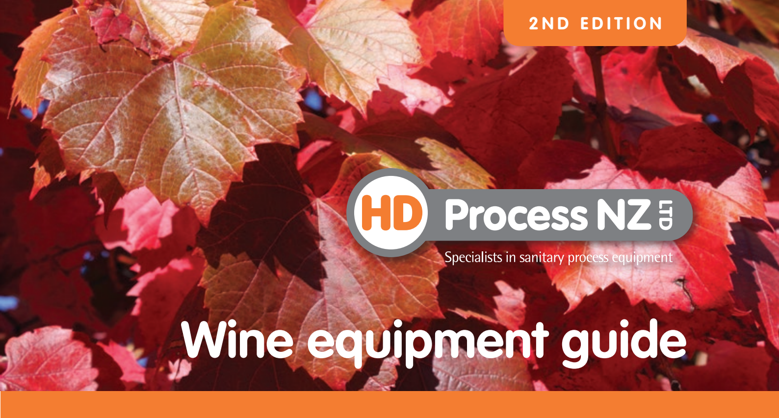
Pumps • Valves • Filters • Flow accessories • Tank equipment