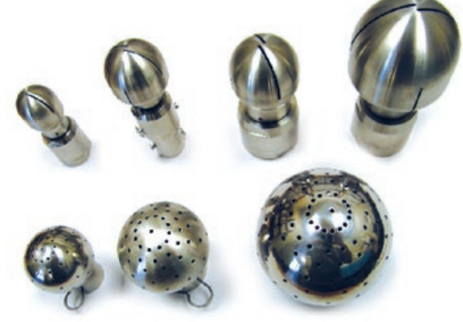
Fixed and rotating sprayheads