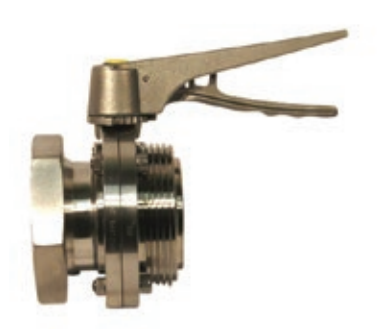
SM butterfly valve with ST handle