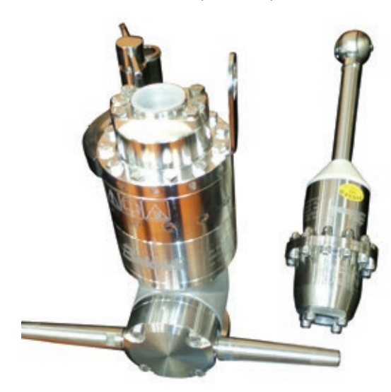
Rotary tank cleaners

• Complete range of tank cleaning equipment to suit all tank sizes from 2,000 to 300,000 litres